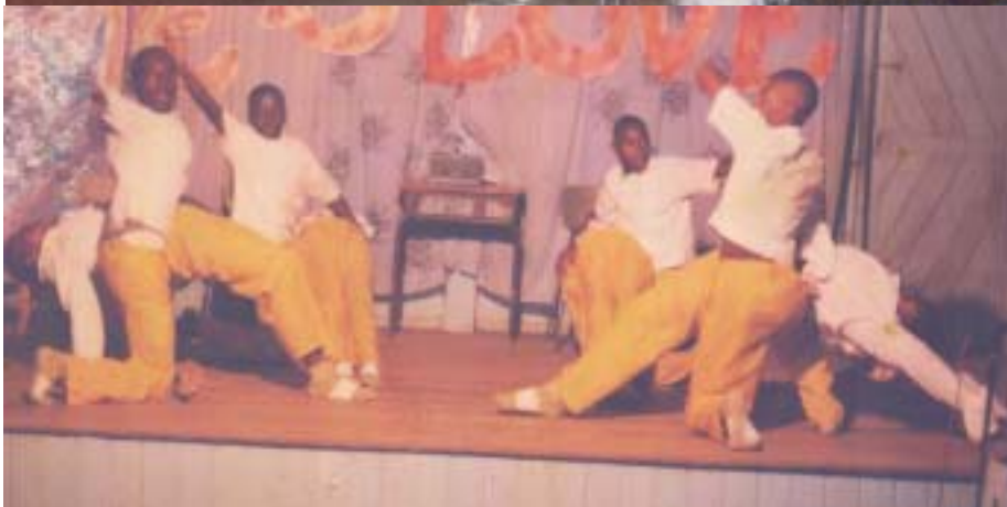
Church service in the East ruimveldt Secondary School